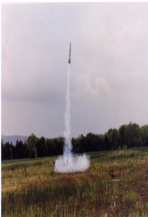
Nice V2 at BP