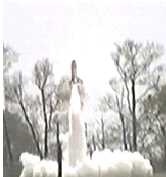
Bomarc M flight at RATS VII