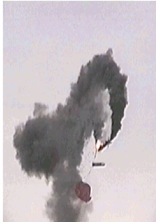
CATO at RATS VII